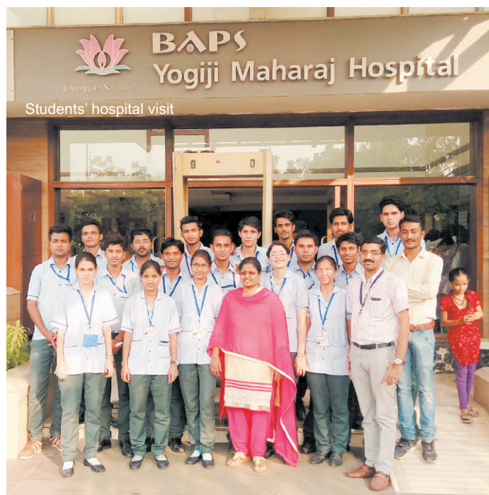
Students' hospital visit

On November 4 and 5, third year graduate nursing students visited the Mental Health Hospital, BAPS Hospital and the Civil Hospital, Ahmedabad.