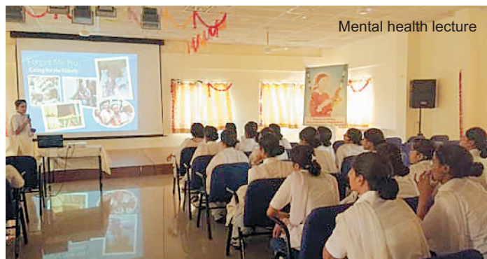
Mental health lecture