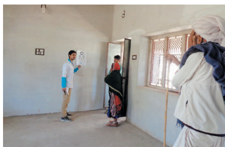
Makeshift arrangements to test villagers' eyes