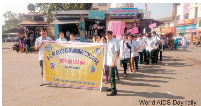
World AIDS Day rally