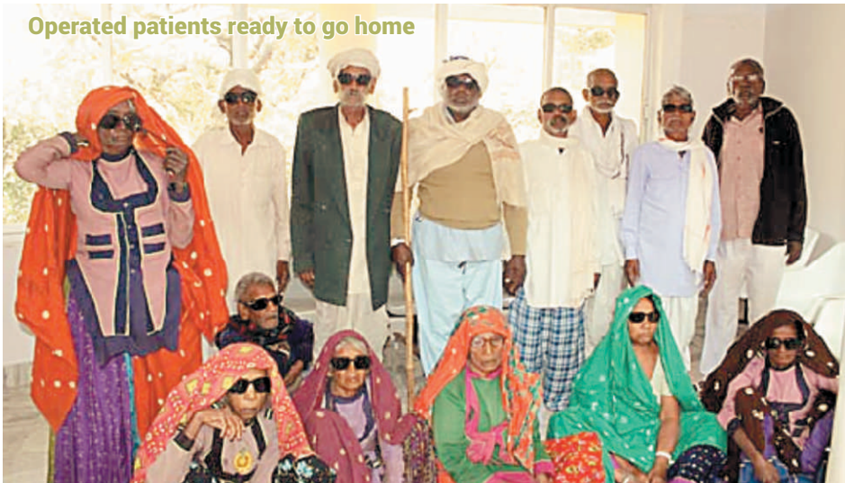
Operated patients ready to go home

October marks the onset of winter in Abu, when eye screening activities pick up at Global Hospital Institute of Ophthalmology. Screening programmes are primarily conducted in towns and villages where eye care is non-existent, with the aim of identifying people needing cataract surgery.