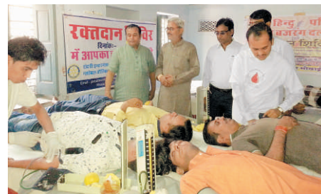
Busy scene at the blood donation camp

Revtara Yuva Sangh of Jalore; HDFC Bank, Abu Road; Muslim Naujavan Committee/Islamia School, Abu Road; Lions Club of Mt Abu and Reodar; Bajrang Dal, etc.