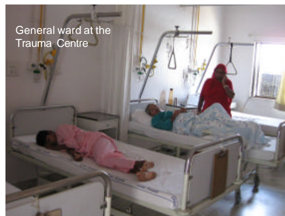
General ward at the Trauma Centre