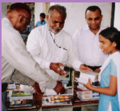
◀ Distributing educational material

Our five Clinics on Wheels have been running since since 2004 (I), 2006 (II), 2008 (III) and 2009 (IV and V) respectively. Each involves a mobile van staffed by a doctor, pharmacist cum nursing assistant and driver. Put together, the five mobile clinics rotate between 73 remote tribal villages having a population of about 139,773. The team offers medical advice and distributes essential medicines. Most of these villages are entirely dependent on our mobile clinic and are not served by any Primary Health Centre.