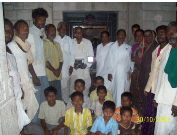
Flood affected victims are distributed solar lanterns. In all, 1000 lanterns were distributed.