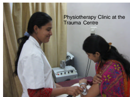
Physiotherapy Clinic at the Trauma Centre