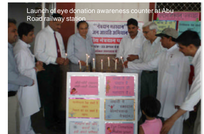
Launch of eye donation awareness counter at Abu Road railway station