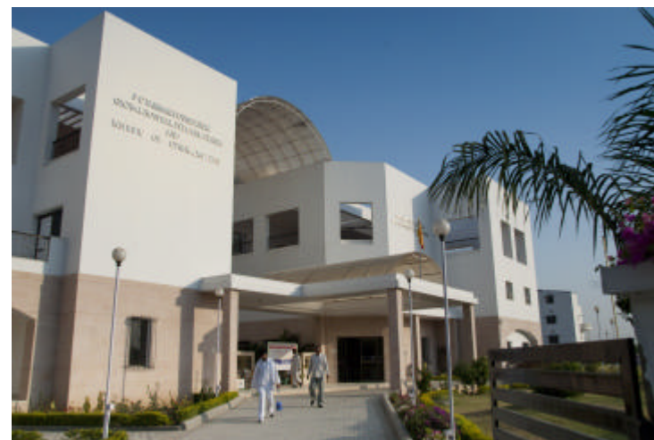
Radha Mohan Mehrotra Global Hospital Trauma Centre & P C Parmar Global Hospital Eye Care Centre

Our blood bank conducts tests to ensure that blood is free of malarial infections prior to transfusions. It also offers screening for out-patients. During the year, 749 samples were screened for malaria of which 35 were found to be positive.