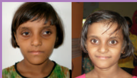
▲ A paediatric squint case, before and after surgery