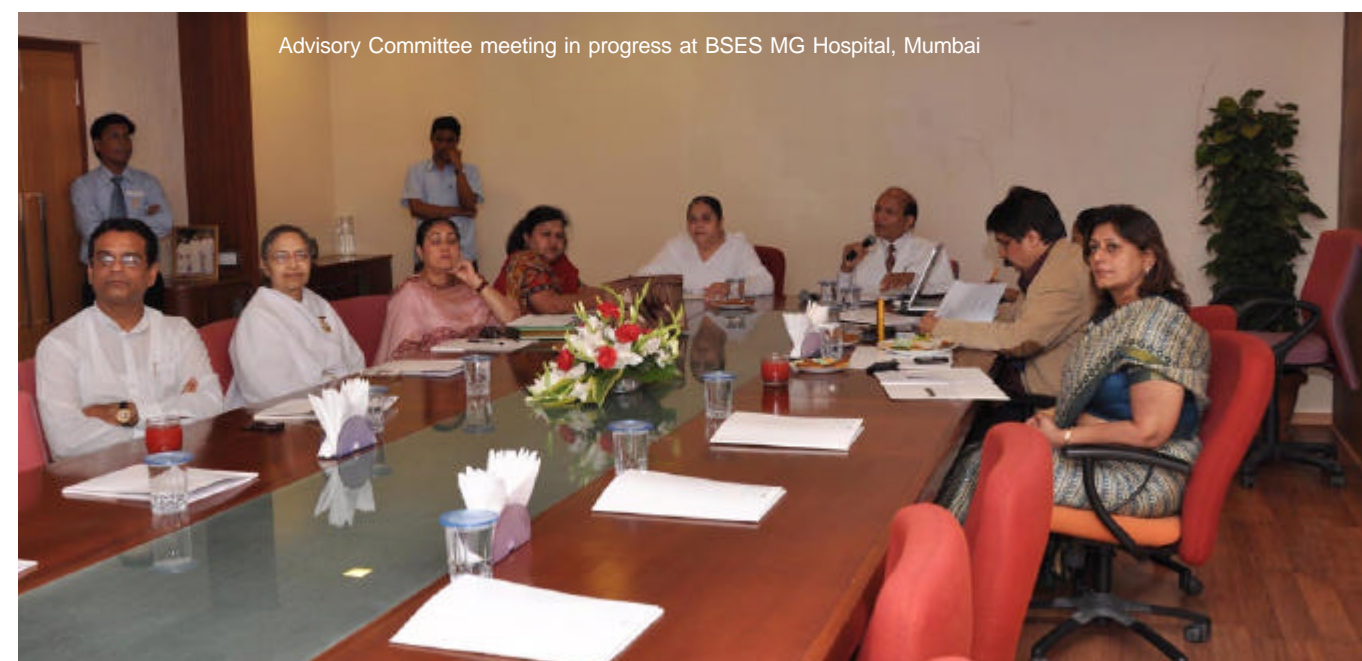
Advisory Committee meeting in progress at BSES MG Hospital, Mumbai

received an award from the Zonal Transplant Coordination Centre (Mumbai).