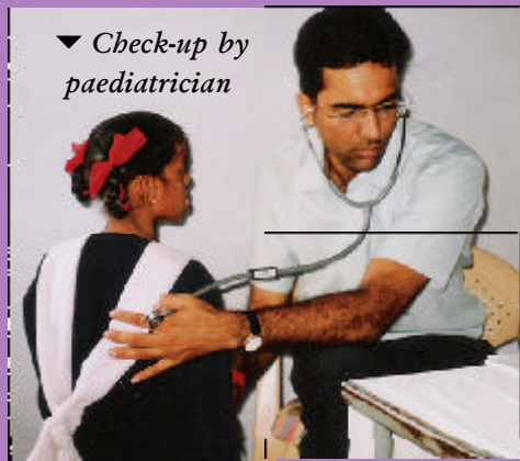
▼ Check-up by paediatrician