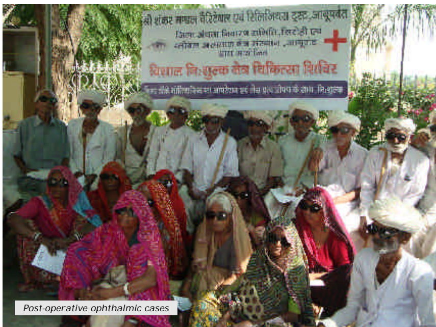
Post-operative ophthalmic cases

The support of the P C Parmar Foundation of Pune helped commission a Global Hospital Vision Centre in village Kalindri in district Sirohi last December. A similar vision centre had been launched in village Raniwada in the previous year. Vision centres function as rural community eye clinics, performing a wide range of examinations for which the community would otherwise have to travel afar. They are well equipped with modern diagnostic aids, such as a slit lamp, lensometer, trial set for refractions, ophthalmoscope, retinoscope, autoclave and minor instruments. Last year, the Raniwada vision centre served 3864 patients and the one at Kalindri saw 1164 patients. In all, the two centres performed 120 minor procedures and 2058 refractions. Also, 1909 patients were screened for cataract at 17 field locations. Of these, 223 patients were surgically treated. Eight school screening programmes were organised, at which 1024 students were checked.