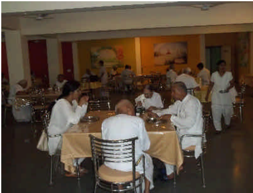
The dining area in Shivmani Geriatric Home offers residents a stylish yet homely ambience