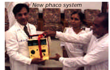
New phaco system

Out-Patient Department — Streak Retinoscope Set 3.5V from WelchAllyn Inc. USA