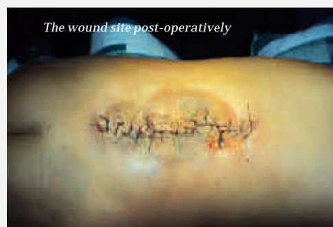
The wound site post-operatively