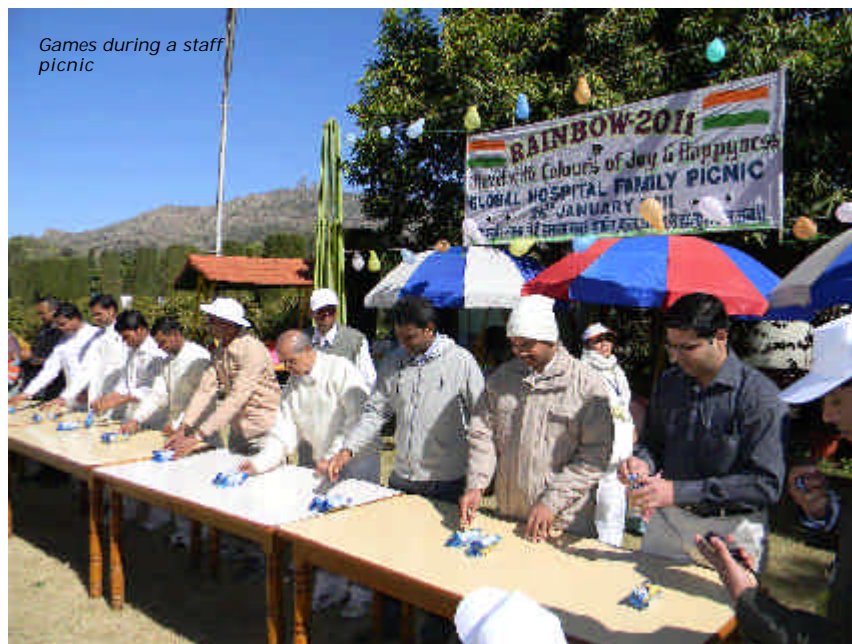
Games during a staff picnic