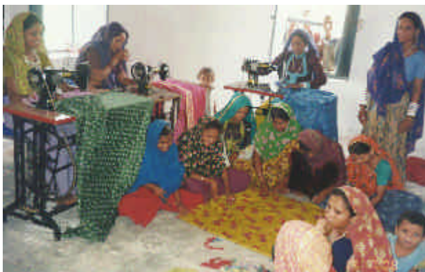
Above: Women participants of the VOP's sewing project at work in village Chandela

Women participating in the VOP sewing project in villages Aarna, Chandela and Salgaon continued to benefit from the pocket money they earn from working as seamstresses.