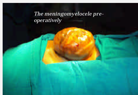
The meningomyelocele pre-operatively