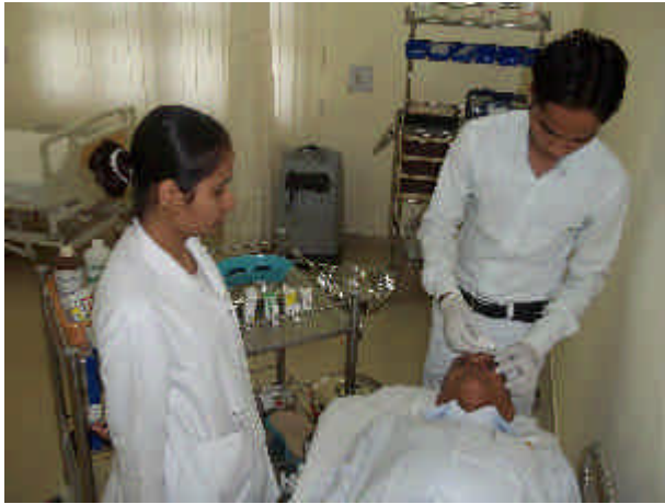
A well equipped nursing station within Shivmani Geriatric Home is staffed by nurses round the clock