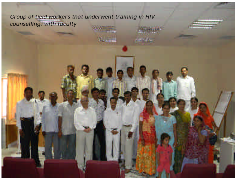
Group of field workers that underwent training in HIV counselling, with faculty