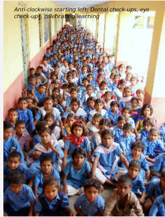
Anti-clockwise starting left: Dental check-ups, eye check-ups, celebrating learning

The school authorities also receive classroom educational aids and materials to facilitate and improve the quality of extra-curricular and sports activities.