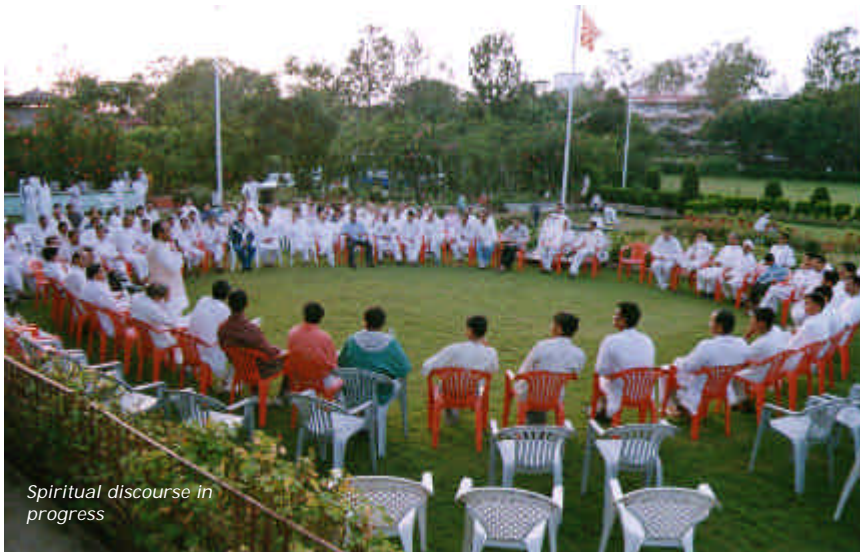
Spiritual discourse in progress

The IndiaCare Trust, Germany, has supported the activities of the flagship unit at Mount Abu almost since its inception. It has channelled considerable contributions of equipment and consumables our way.