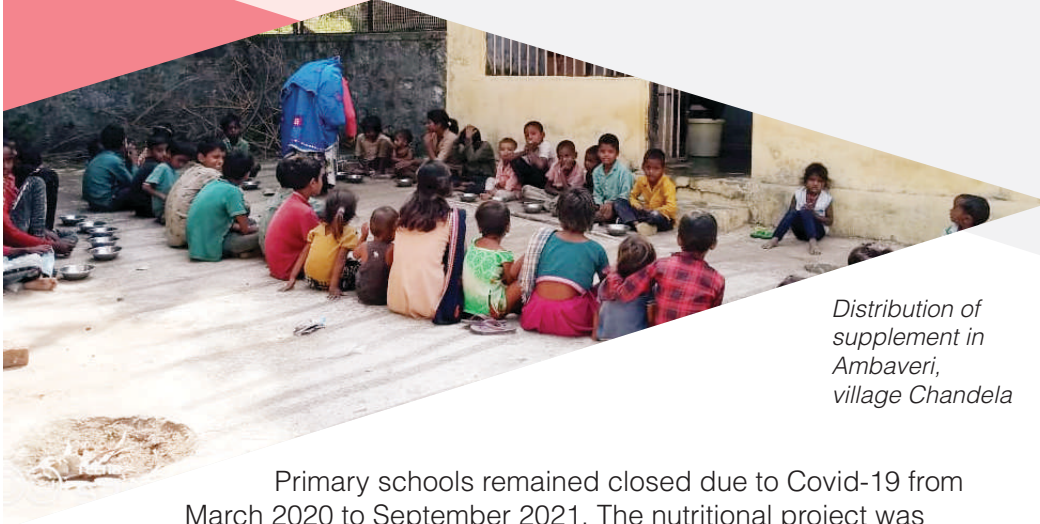
Distribution of supplement in Ambaveri, village Chandela

Primary schools remained closed due to Covid-19 from March 2020 to September 2021. The nutritional project was stalled throughout. With the reopening of schools in October, the distribution of a nutritional supplement to students during school hours resumed.