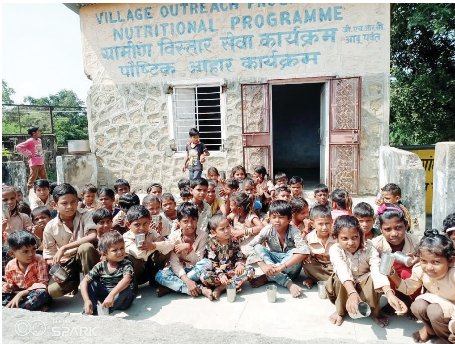
Distribution of supplement in Bageriphali, village Chandela