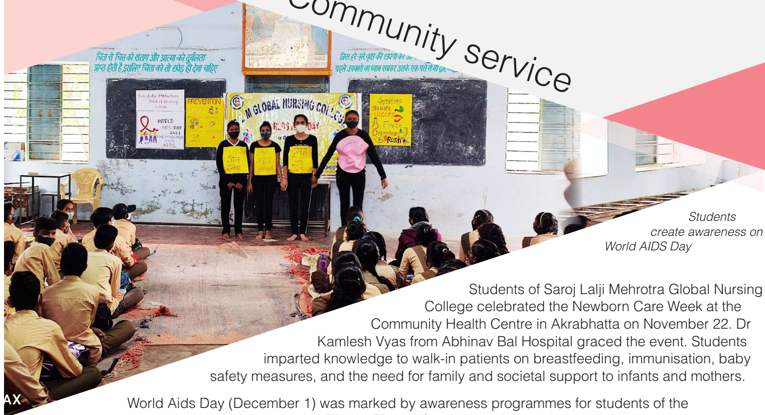
Students create awareness on World AIDS Day