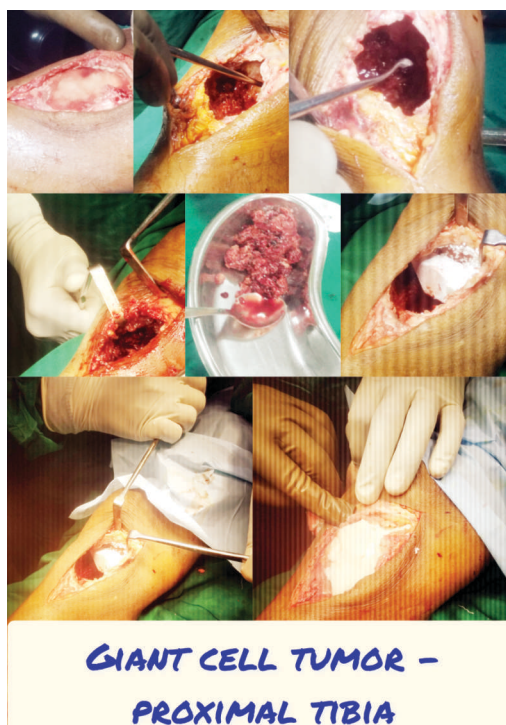
A collage of different stages of the operation

Since the patient was from a low income background, he was operated on under the Mukhya Mantri Chiranjeevi Swasthya Bima Yojana, a health insurance initiative for the poor by the state government.