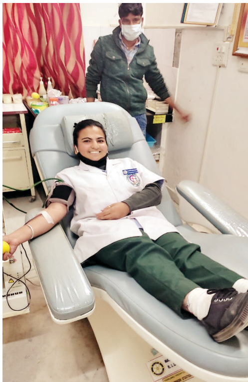
A student donates blood

The blood bank issued 1559 units, 316 for no charges. 71 thalassemia patients registered with the bank availed transfusions.