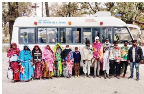
Patients transported to J Watumull Global Hospital & Research Centre, Mt Abu

The community team found that seriously ill patients seen by the mobile clinics in villages and referred to J Watumull Global Hospital & Research Centre for further care, often did not make it to the base because they lacked a means of transportation. Therefore, in January, a weekly bus service was instituted to ferry villagers needing hospitalisation to Mt Abu. The bus starts from village Bhaisa Singh, in Abu Road tehsil, which has been publicised as a pickup point.