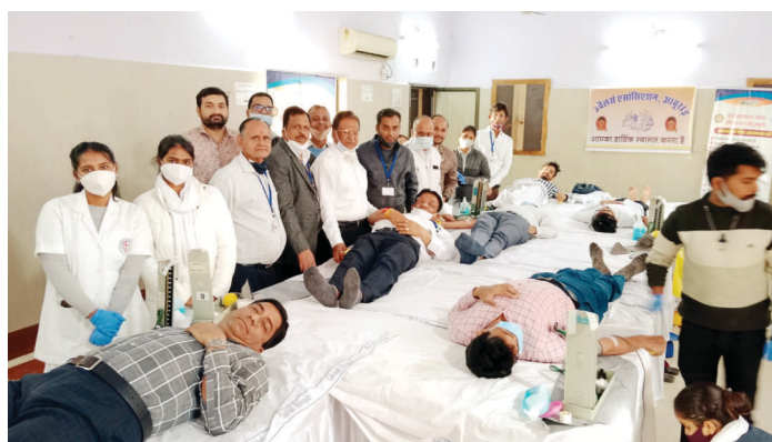
A donation drive arranged with the Jewellers Association of Abu Road yielded 101 units

Donors at the Rotary International Global Hospital Blood Bank numbered 1525 with 742 of those coming from nine donation drives. Three drives yielded more than 100 units each. These included an event with the Shri Rashtriya Rajput Karni Sena of Mt Abu (228 units), another with the Muslim Youth Committee of Abu Road (122 units) and one with the Jewellers Association of Abu Road (101 units). The blood bank issued 1399 units, 424 for no charges. Eighty thalassemia patients registered with the bank availed transfusions.