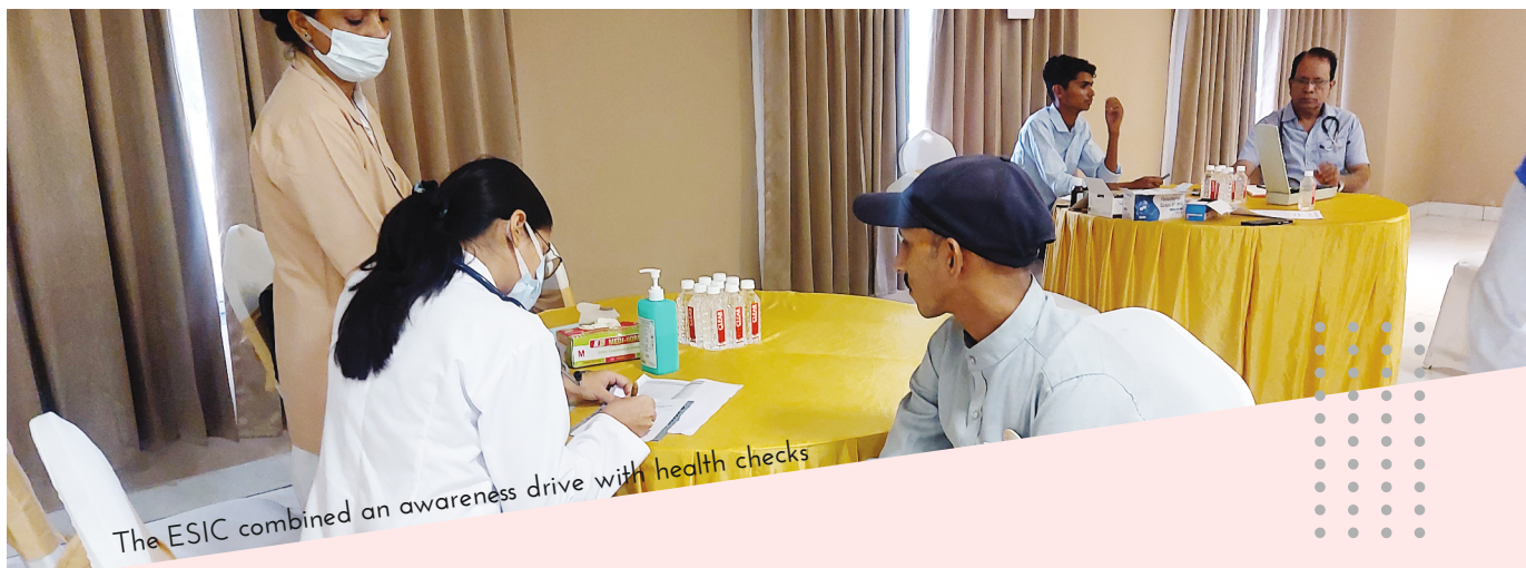
The ESIC combined an awareness drive with health checks