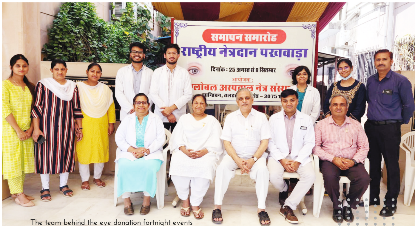
The team behind the eye donation fortnight events