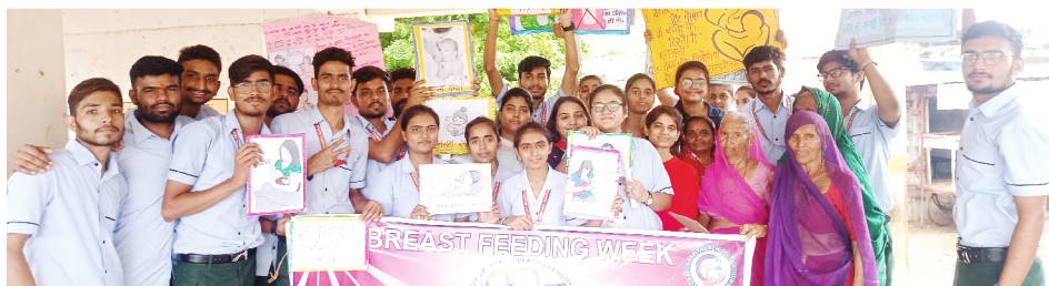
Creating awareness of the importance of breastfeeding

World Breastfeeding Week that lasts from August 1 to 7 every year was commemorated on August 8. Graduate students presented skits in the Community Health Centre (Akrabhatta) and in a Primary Health Centre (Bharja).