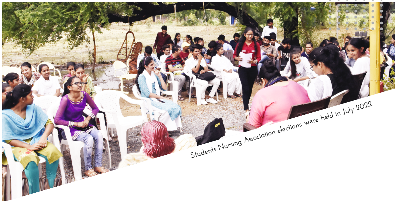
Students Nursing Association elections were held in July 2022

World Breastfeeding Week that lasts from August 1 to 7 every year was commemorated on August 8. Graduate students presented skits in the Community Health Centre (Akrabhatta) and in a Primary Health Centre (Bharja).